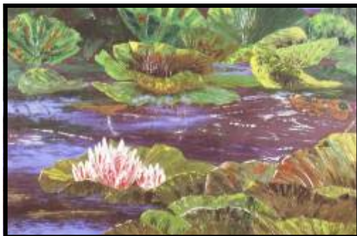
Lilies. Oil Paint

Monet regularly completed an eighteen by twenty four inch canvass in a couple of hours so you should go home with several completed paintings.