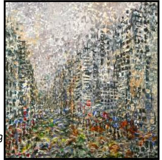
Market day. Oil

Monet was passionate about painting from life and if the weather is kind to us we will be working out in the surrounding area. If not we can work in the studio from photographs or a selection of sketches I can provide.